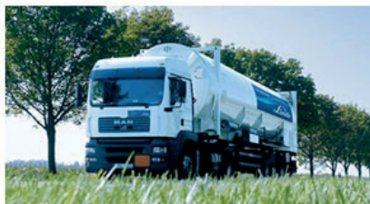
Liquid hydrogen (LH 2 )

Economical transport for short to medium distances