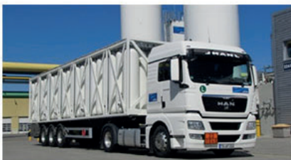
Compressed gaseous hydrogen (CGH 2 )

Supply of hydrogen to electronics customers has historically been driven by regional source types, engineering and transportation codes, and by end user preferences and process qualification. However, steep demand curves are causing users to consider new supply schemes for access to larger volumes,